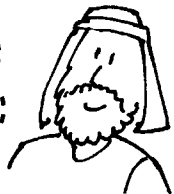
James, son of Alphaeus